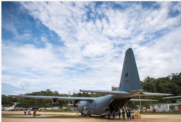
The RAAF C-130J delivering supplies to the earthquake-affected Highlands

AUSTRALIA IS SUPPORTING PAPUA NEW GUINEA IN ITS RESPONSE TO THE EARTHQUAKE IN HELA, SOUTHERN HIGHLANDS, WESTERN AND ENGA PROVINCES