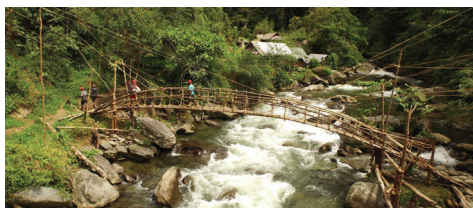
The Kokoda Initiative, in partnership with Kokoda Track Authority, keeps the track safe for trekkers and locals.