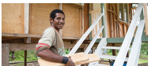
The Kokoda Initiative has supported local communities through the provision of vital infrastructure. Double classrooms, staff houses, clinics and sanitation infrastructure have been constructed in villages throughout the Kokoda Track.