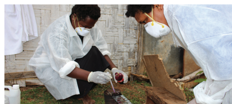
KI-supported health workers conduct tuberculosis tests in the field, speeding up diagnosis and enabling faster treatment of TB-positive patients.