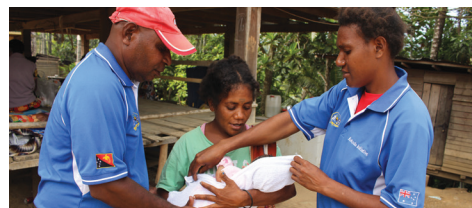
KI supports maternal and child health in track communities through its network of Village Health Volunteers.