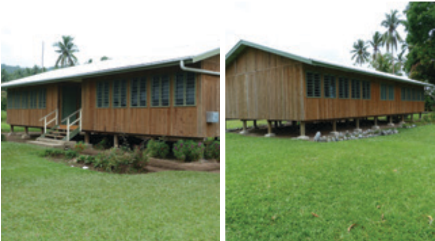
Left: Tinputz Primary School, 22 February 2014 | Right: Asitavi Primary School, 20 February 2014

In 2012 and 2013, Australia supported the roll-out of the PNG Government's Tuition Fee Free Education Policy, which directly benefited more than 50,000 Bougainvillean children and their families.