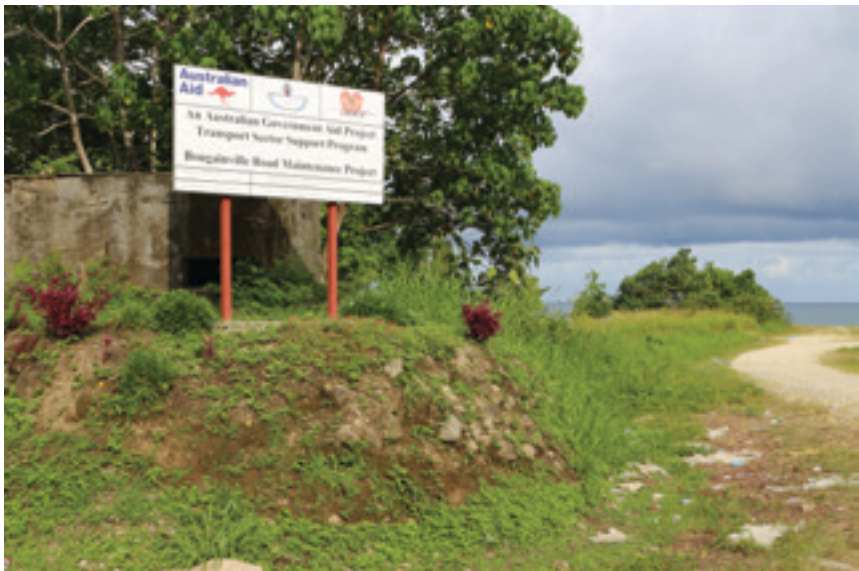
Gravel road near Kangu Wharf Buin, 30 April 2014

Australia maintains hundreds of kilometres of gravel road. This allows us to spread our assistance more widely, meaning greater numbers of Bougainvilleans benefit.