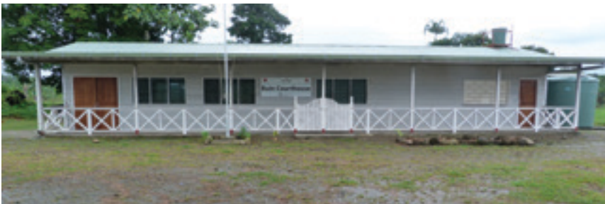
Court House in Buin, 20 February 2014