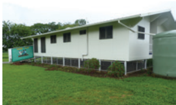
Left: Arawa STI Clinic, October 2013 | Right: Buin STI Clinic, 21 February 2014