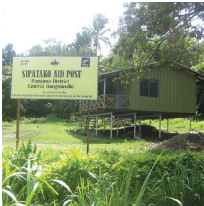
Sipatako Aid Post, Panguna

In 2013, Australia provided six health scholarships for students currently living and working in Bougainville. These included four Midwifery Awards and two Community Health Worker Training Awards. Australia is providing a technical adviser to the ABG Department of Health.