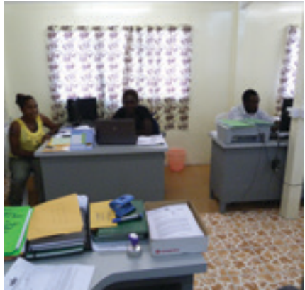
Left: Refurbished BPS accommodation in Arawa | Right: Staff at work in the refurbished Human Resources Division

Through advisory services and non advisory technical assistance, Australia is strengthening the governance and administrative capacities of the ABG.