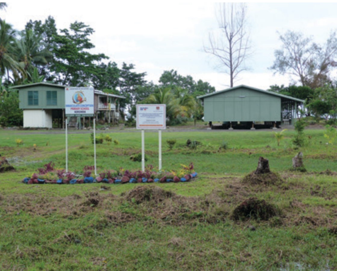
Koromira Primary School, 21 February 2014

The table below shows beneficiary schools