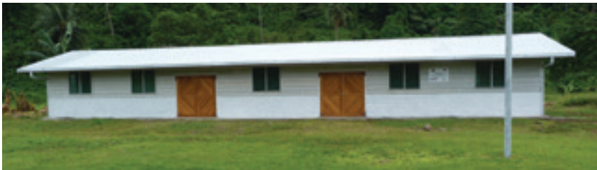
Koromira High School Science Laboratory