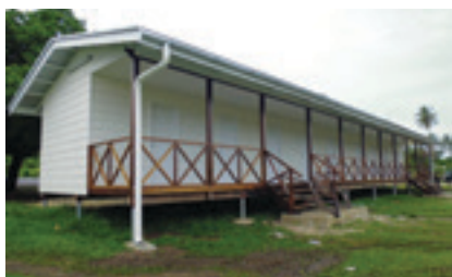
Left: Computer training at the BPS Training Centre | Right: Eight person dormitory at the BPS Training Centre