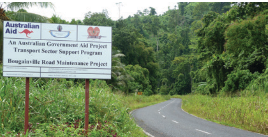
Resealed section of road near Arawa, 22 February 2014

Moreover, trunk road rehabilitation and maintenance have created, and continue to create, employment opportunities for many Bougainvilleans.