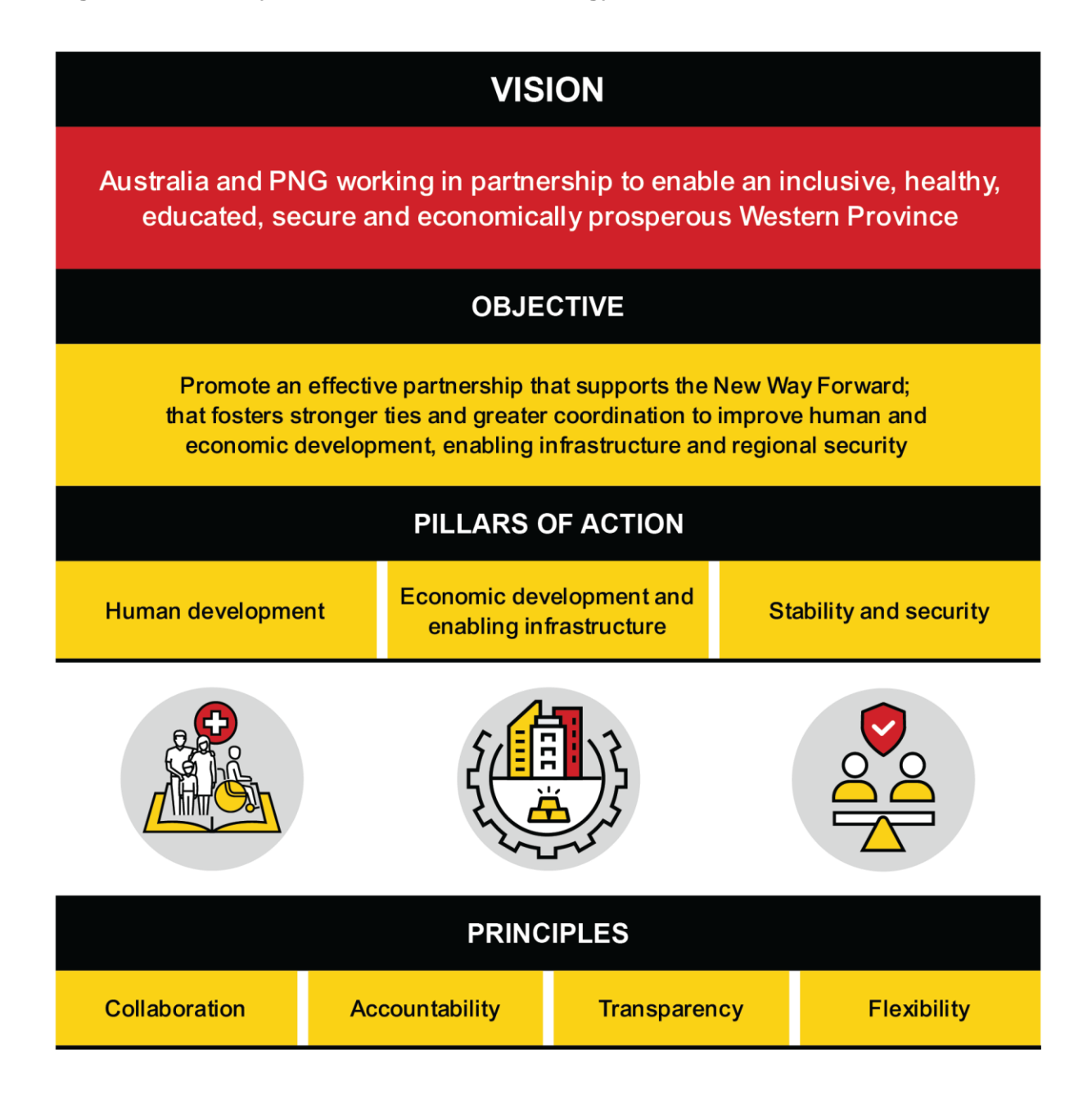
Figure 2: Summary of Western Province Strategy Structure