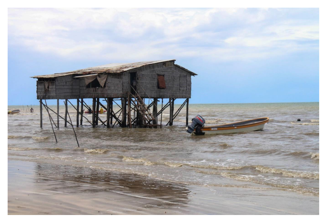
Figure 3: Treaty village house impacted by rising high tides

Sea-level rise and induced king tides are already having adverse effects on Western coastal communities, with reports that communities are witnessing greater variations in climate, including more severe dry periods followed by heavier rain and unprecedented flooding. An increasingly unpredictable climate will also impact agricultural productivity, health, and the ability of people to sustain their livelihoods.